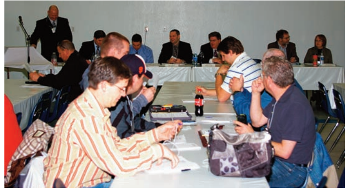
Members at work at AGM

BE IT RESOLVED THAT: whatever policies and procedures are in place at October 31st, pertaining to the Saskatchewan College of Paramedics Continuing Medical Education process, remain in place for the next twelve months.