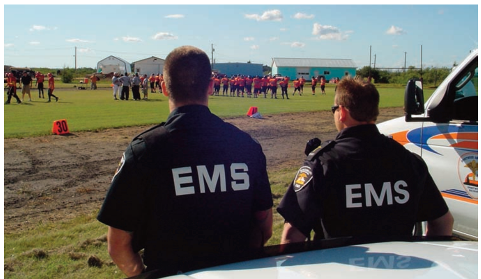
Spiritwood – Big River EMS SCoP members stand by at a football game

Fenner and Sereda hope to have the first audit underway by September 2010.